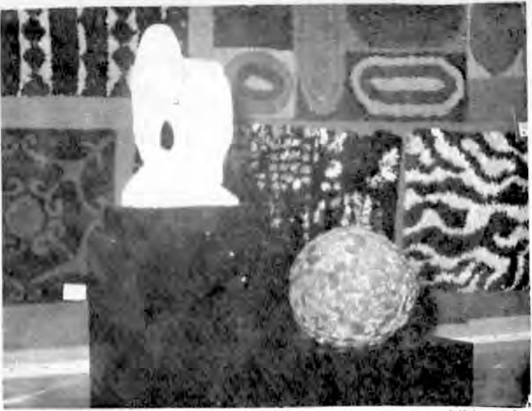
The sculpture shown here is one of the many works on exhibit at the Regional Scholastic Art Awards Show.