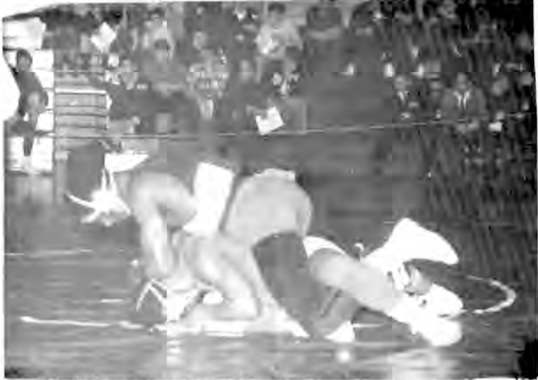
LaSalle's wrestling champ, Jim Day, tries to work a cross body ride, ("the guillotine") to pin his sectional opponent.