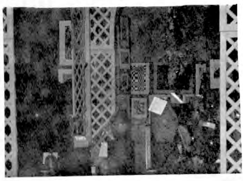
Also included in the art show are various drawings, paintings, and