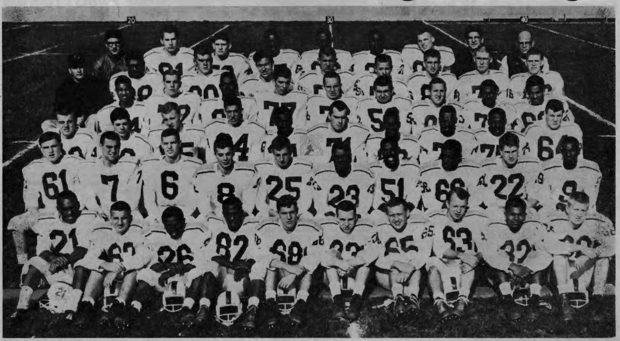
THE MEMBERS OF THE 1961 varsity football squad are pictured above with the four coaches. The team, in quest of the conference championship, now has a 6 and 2 season record. Only one loss now mars the conference record of the Jonesmen.