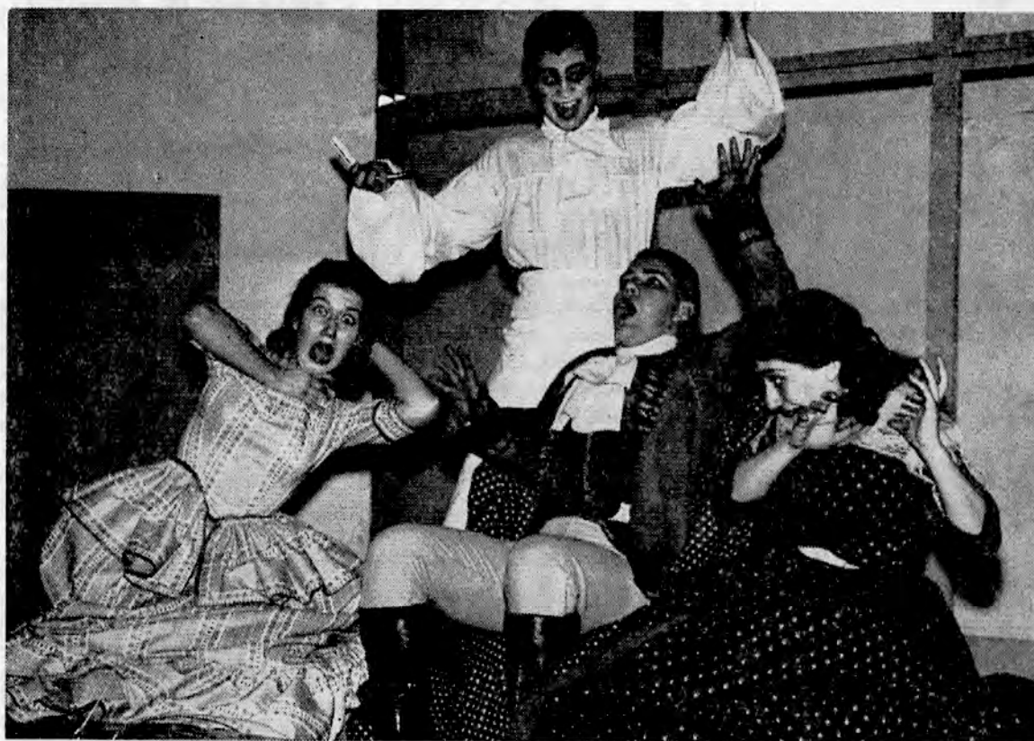
MOST STUDENTS REACTED NORMALLY TO CHIEF NUT SELECTION

WHITE, WASHABLE OPERA LENGTH GLOVES JUST PERFECT FOR PROMS.