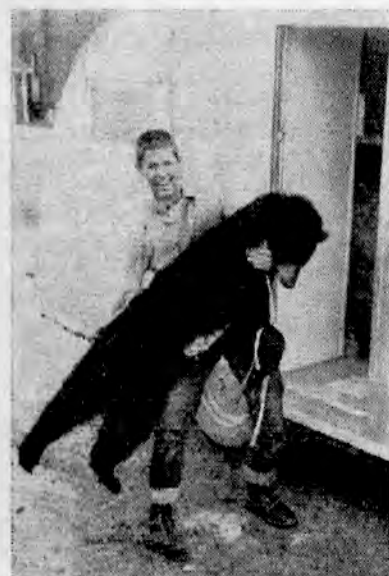
IT SEEMS that Central's Bear was overcome in the rush of students running to vote for Chief Nut and was assisted by a thoughtful student who had already voted.