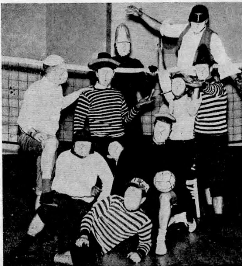
OTHER CANDIDATES WHO CAMPAIGNED FOR CHIEF NUT CROWN.

If this didn't sound like Ogden Nash, it's all right; he didn't write it. MORAL: If you don't like Ogden Nash, don't read the above article.