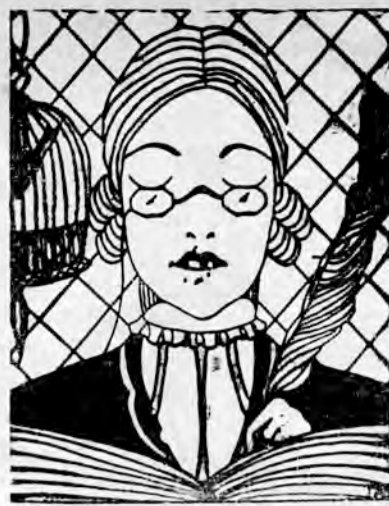
VERIE SAUER SAYS:

MYSTERY MISTER: Classification: Best in the state. Age: 81 years. Home Room: Main Office. Height: Three stories. Weight: Like a ton of bricks. Eyes: Sorta glassy. Hair: Tar black. Activities: Everything there is to do.