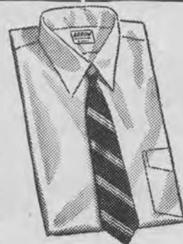
The Best-Liked White Shirt in the World

It's tragic when you're out With your favorite skirt, Not to have the special magic Of an Arrow White Shirt!