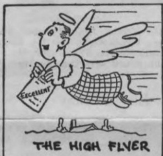
THE HIGH FLYER