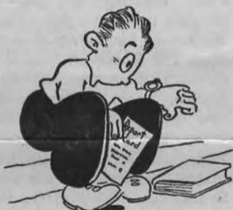
THE BOY WHO WAITS AS LONG AS POSSIBLE