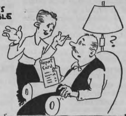
THE BOY WHO EXPLAINS THE GRADES ARE REALLY GOOD