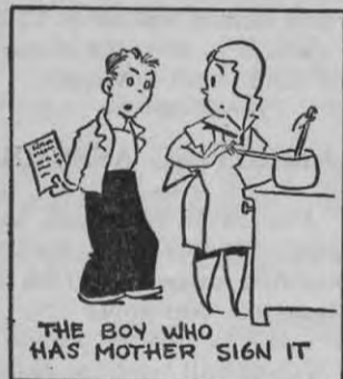
THE BOY WHO HAS MOTHER SIGN IT