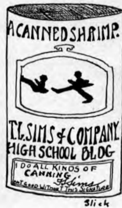
One of the Place Cards at the Dedication Banquet